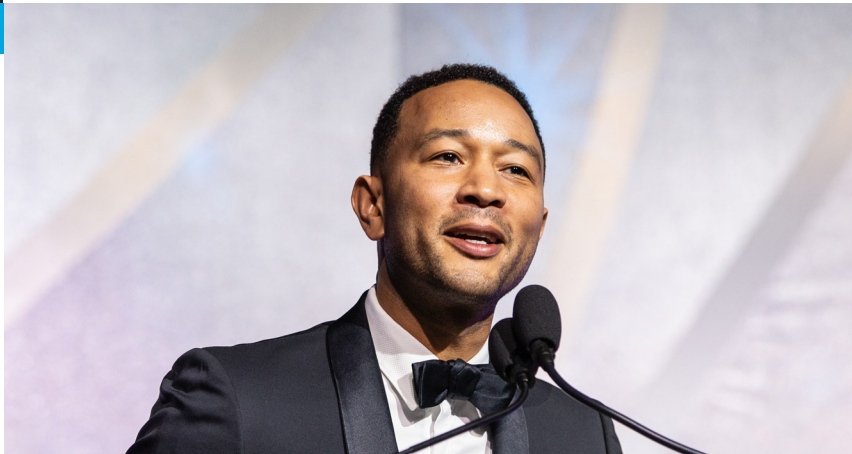
2019 Honoree John Legend

62 NAB RADIO AND TELEVISION BOARD MEMBERS IN ATTENDANCE