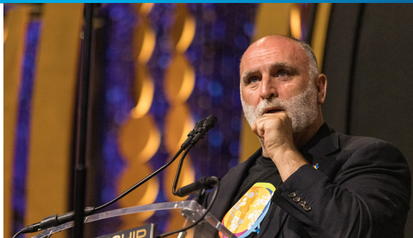
2022 Honoree José Andrés

20+ C-LEVEL EXECUTIVES FROM MAJOR BROADCAST COMPANIES